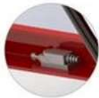
Height limit switch