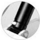
Safety valve for anti-explosion of hydraulic system