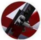
Precision machined safety locks